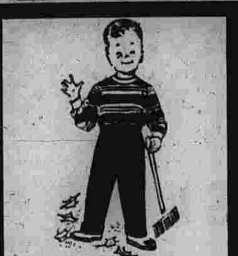
Values to 1.99! Children's Boxer Waist