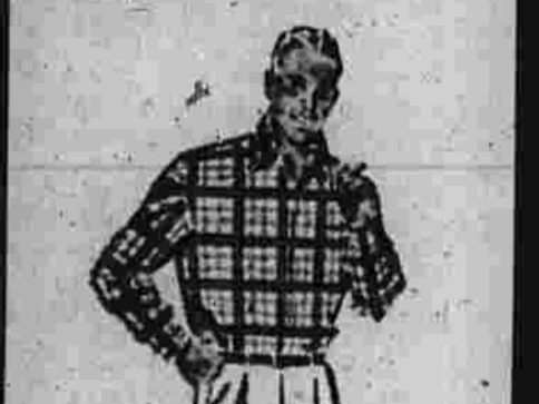
Values to 2.99! MEN'S LONG SLEEVE