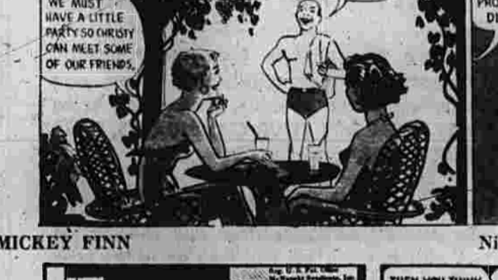
MICKEY FINN BY LANK LEONARD