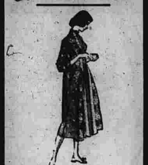
Values to 1.98 LADIES'