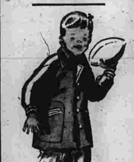
VALUES TO 4.98! BOYS' and GIRLS'