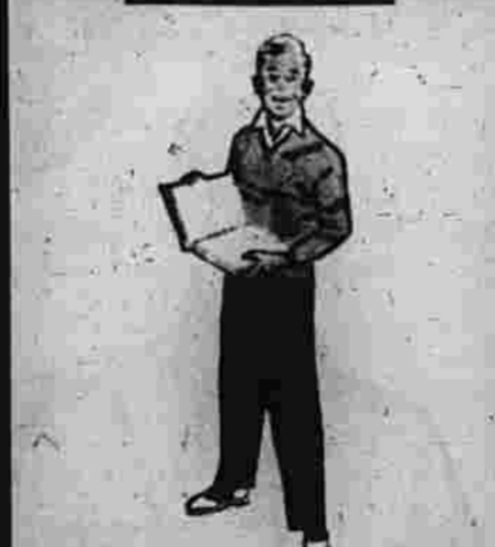
VALUES TO 3.98! BOYS' EXTRA HEAVY