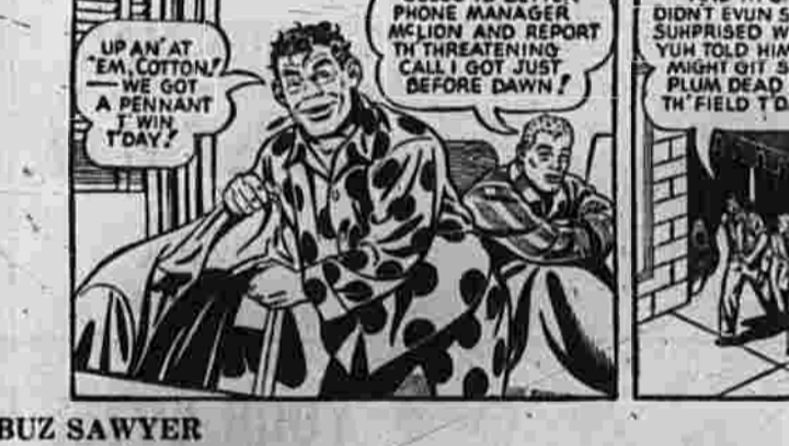
BUZ SAWYER BY JOE CRANE