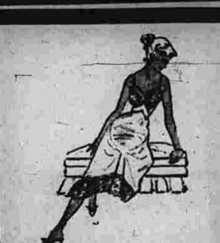
VALUES TO 1.98! LADIES' 100%