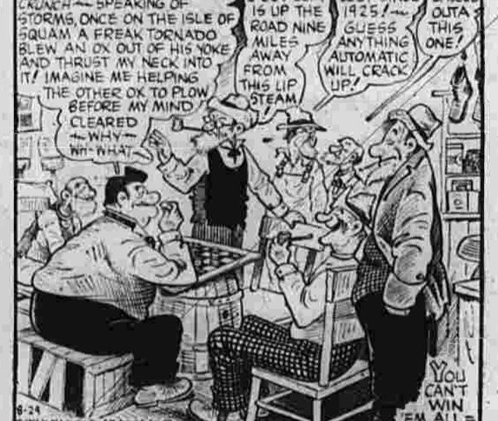
So Long, Gang! BY V. T. HAMLIN